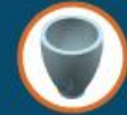
3D CAD Model