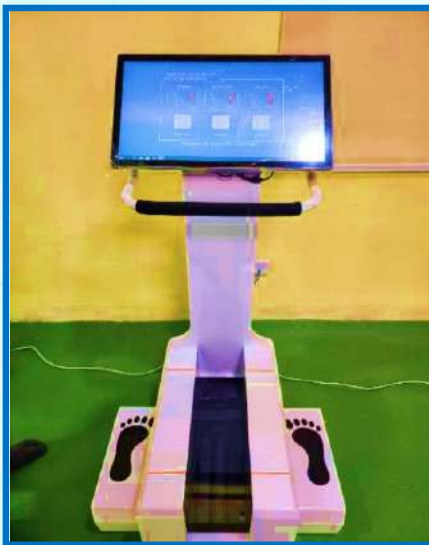
Ka Thermal Foot Scanner