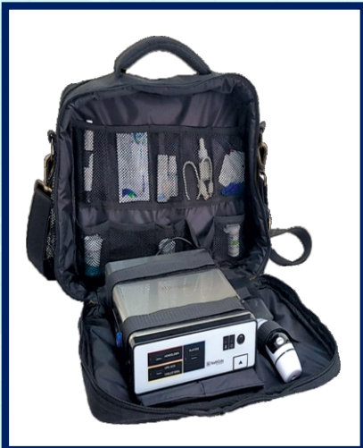
Ka Cube Device ba lah ban rah