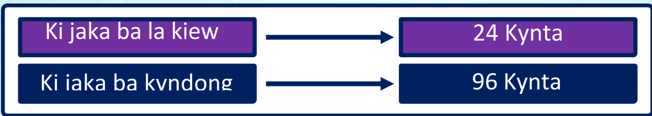
Ka lad ba 1