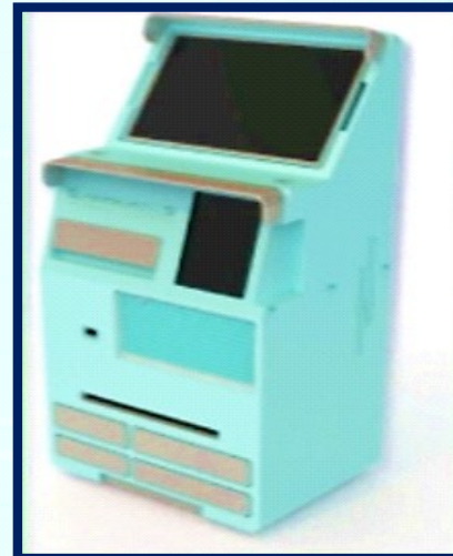
Ka Blood Test Kiosk