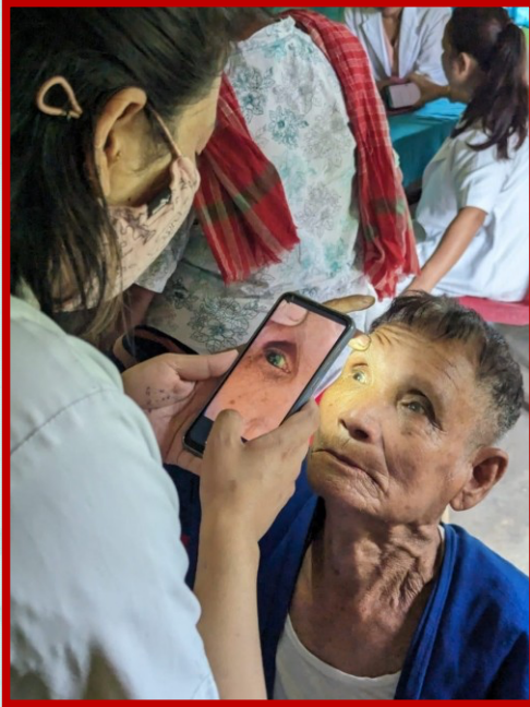
Ki Jingej jong ka Jingsumar Khmat HA ki nongkyndong jong ka INDIA

Lah ban ioh ia ka AI lyngba ka WhatsApp bot na ka bynta ka jingiakren kaba suk