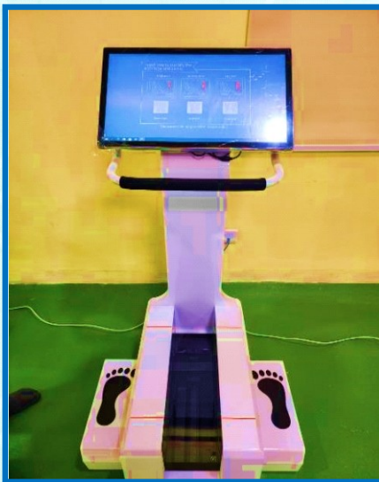
Ke endikna khawl