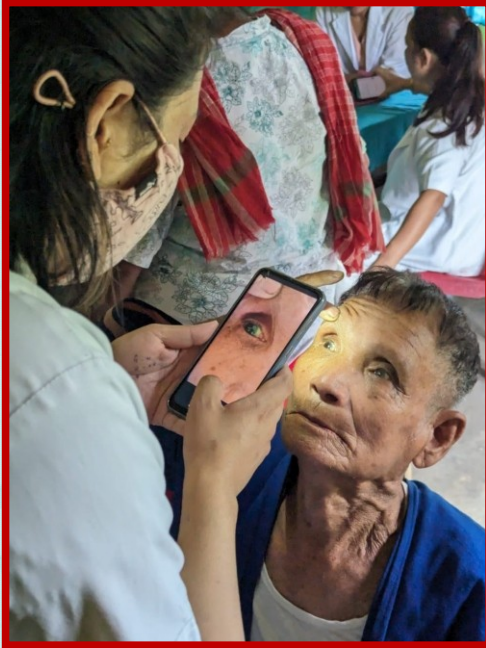
Rural India a mit enkawlna a rokhawlna awm thei te

Hemi AI platform hi WhatsApp bot hmangin awlsam takin a hman theih a ni.