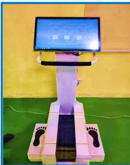
Ja-a-ko Scan ka-ani