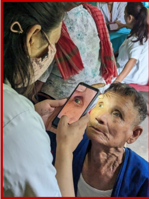
Mikron Saanirangko sananio India-o champenganirang

AI platform-ko Whatsapp gita jakkalna gita man-a aro nengrae nengnika gri agangrikaniko dakna gita man-a.