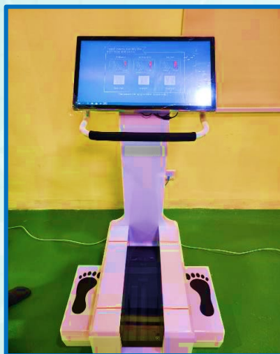
Thermal Foot Scanner