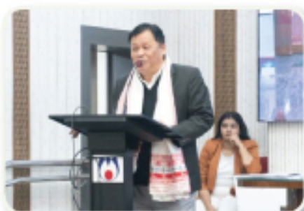
Sh Nirupam Chakma Member, National Commission for Scheduled Tribes. Govt of India