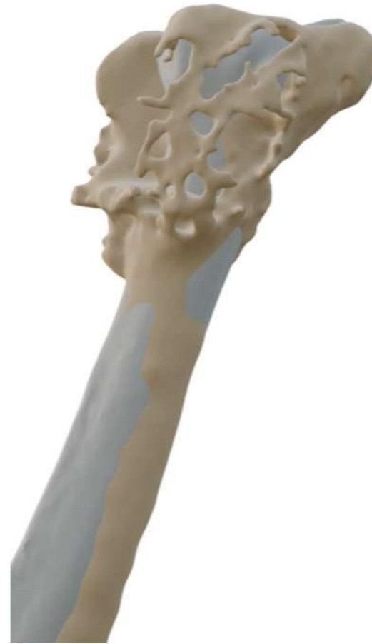
Grey - Mirrored