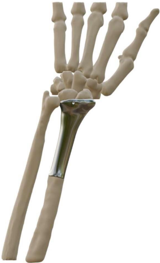
Implant design on Resected Side