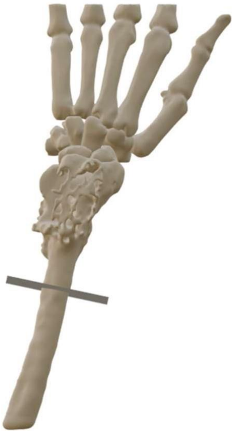
Radius Resection at 80 mm